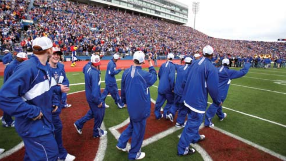
Fans of all ages welcome the team home at the April 8 championship celebration at Memorial Stadium.